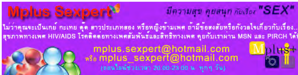
Figure 3: Mplus Sexpert! Advert