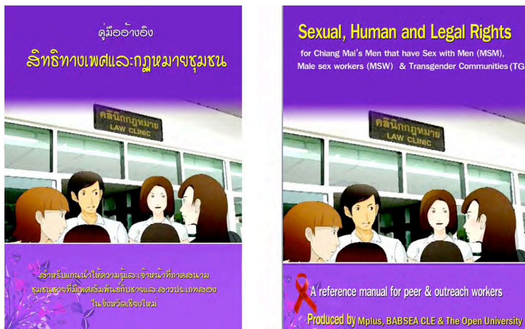
Figure 2: Sexual, human and legal rights manual produced by BABSEA CLE, Mplus and The Open University

These efforts produced a 72 pages manual entitled Sexual, human and legal rights for Chiang Mai's men that have sex with men (MSM), male sex workers (MSW) and transgender (TG) communities ii (Figure 1). The manual is an invaluable resource for peer educators and counsellors. It provides them a structured approach to support gay men, other MSM, male sex workers (MSW), transgenders and transgender sex workers understand HIV prevention and their human, legal and sexual rights under Thai law. Twelve peer educators were trained to use this manual for both face-to-face and online support in both programmes. The manual provides a comprehensive listing of references to access local rights and referrals to health services, including free voluntary confidential counselling and testing (VCCT) and university-based clinical legal education (CLE). Both programmes also make use of a number of educational digital animations to help young gay men, male sex workers, transgenders and 'hidden' MSM understand personal risk to HIV and how to access justice when an individual finds their rights violated. These animations were designed through behavioural research done by and with these populations. (Walsh, 2011; Walsh, Laskey and Morrish, 2011; Walsh, Chaiyakit, and Thepsai, 2010).