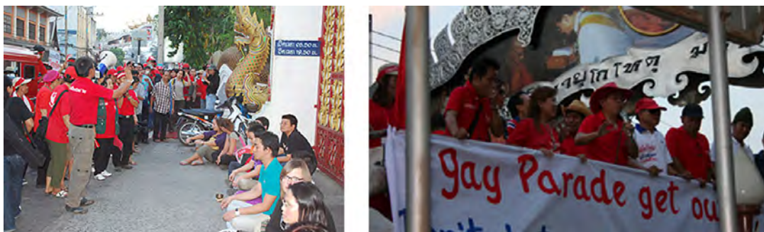
Figure 1: Parade participants' non-violent response to the Chiang Mai Rak 51's 'gay parade get out' public rally to cancel the 2009 Chiang Mai Gay Pride Parade