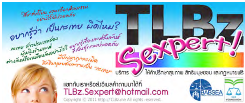
Figure 4: TLBz Sexpert! Advert

The amfAR funding ran out for the Mplus Sexpert programme in 2011. Even though it was extremely successful, it was not continued. The reasons for this are complex and discouraging, considering its impact and the number of successful chats over six months. Not wanting to lose the momentum in the Sexperts approach among the community, we lobbied a number of other Thai organisations committed to fighting HIV to see if they would be willing to launch a similar programme. ThaiLadyBoyz, or www.TLBZ.me an online community-based and led Internet community for transgenders agreed. The OPOP received funding through the BABSEA CLE and the Thai CLE foundation to continue a form of the Mplus Sexpert programme hosted on their website. The primary difference was that it was marketed and adapted to meet the needs of male to female (M2F) transgenders across Thailand. This OPOP was named TLBz Sexperts! (Figure 3). The funding is used to pay peer TLBz Sexperts! to run an online peer-counselling service for three hours a day, five days a week.