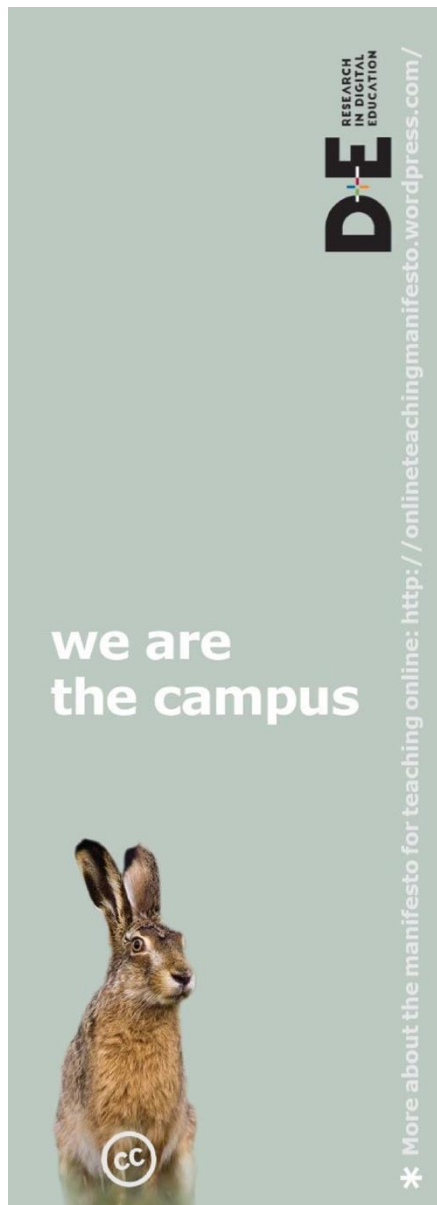
Figure 3: We are the campus