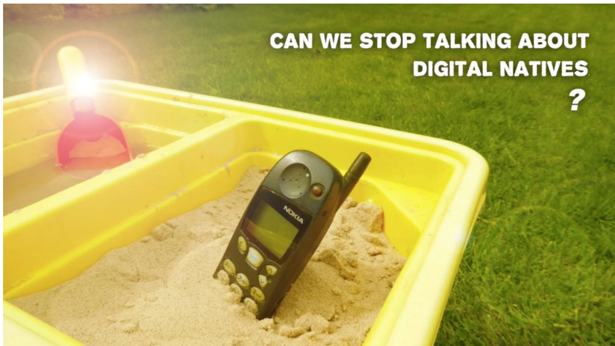
Figure 2: “Can we stop talking about digital natives?” – still from Manifesto for Teaching Online video, 2016.

Each point of the manifesto was deliberately interpretable, and it was made open so that others could remix and rewrite it. In early 2015, the Digital Education group itself began to revisit and reassemble the manifesto, a process which took place over approximately six months and multiple meetings, iterations and discussions among a larger team of nine colleagues. The table below lists the statements from the 2011 manifesto (left), and the 2016 manifesto (right) with the original order of statements preserved. Changes between the two are underlined on the right. We reproduce them here in order to set the scene for the discussion which follows, but also to convey how the shifts in the wording of the manifesto tell a story of the recent history of digital education and in turn help us understand its possible future trajectories.